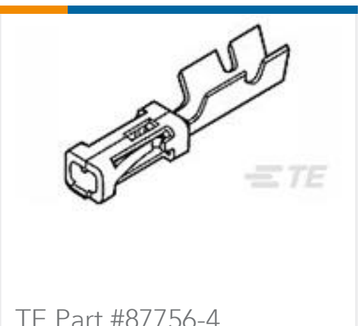
TE Part #87756-4 MOD IV RECP PLTD 15 SEL